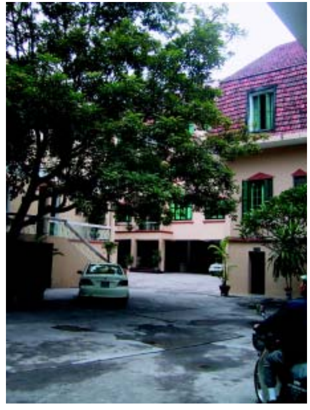
The CIEM building in Hanoi

It is my hope that you will find the selection of articles