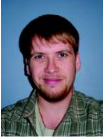
Contact Scholarship in October. He is working on an MA thesis on The Image of Japanese Prostitution in Western Books of the Meiji Era.