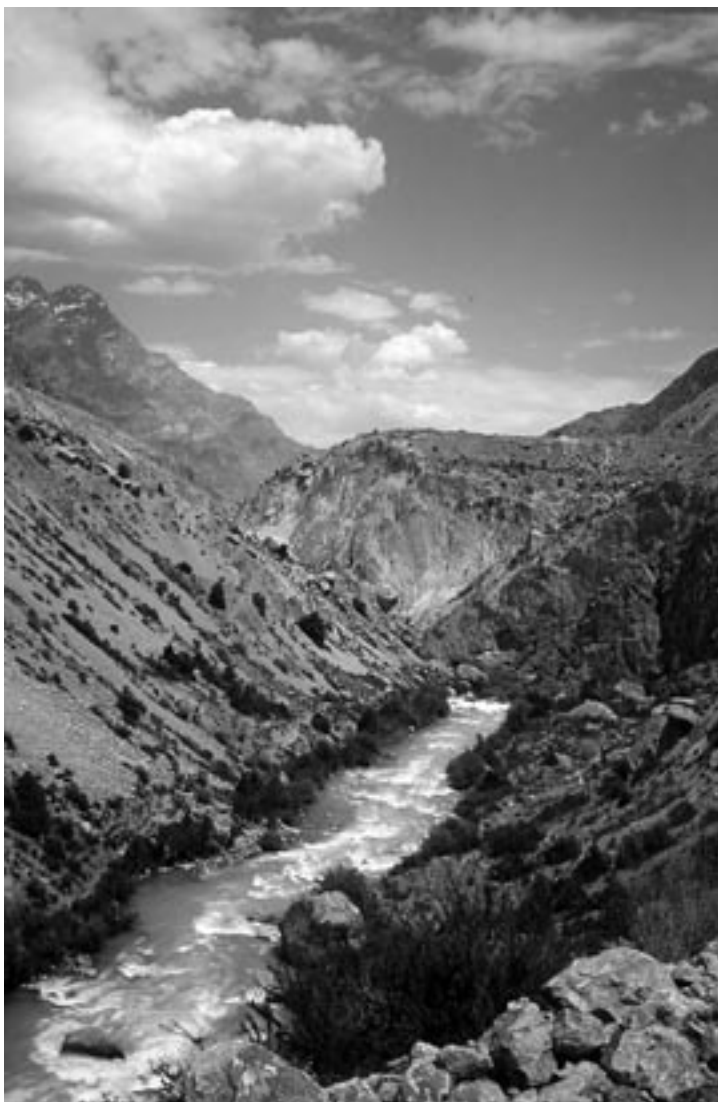
One of the many Central Asian mountain rivers.

used effectively. Kyrgyzstan has realised that it must only be better than the rest of Central Asian states by just one inch – that will be enough to score a victory in this league. There is no talk about the country's potential, only its relative standing compared with the neighbours.