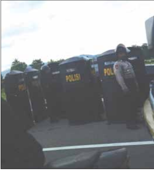
Security behind shields in Ambon.

Foreign Ministry together with the Finnish Embassy in Jakarta. Other governments are welcome to join in the financing of the programme. Perhaps it would be possible, in time, to transform the slave trade into more legitimate forms of work, where slave work would not be needed. Before that, however, there are already several top scholars who have announced their interest in unpaid work.