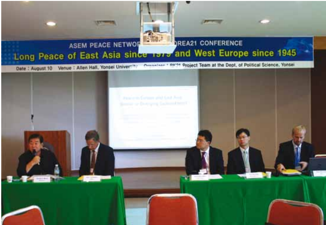
From the 3rd Conference of the ASEM Education Hub of Peace and Conflict Studies.

The East Asian peace has also been characterized by a rise in non-violent conflict, especially in the less democratic, but pacific areas of East Asia, as shown by Isak Svensson and Mathilda Lindgren in this issue. Could non-violent protest be a safety valve or an alternative for more violent expressions of grievances and dissatisfaction?