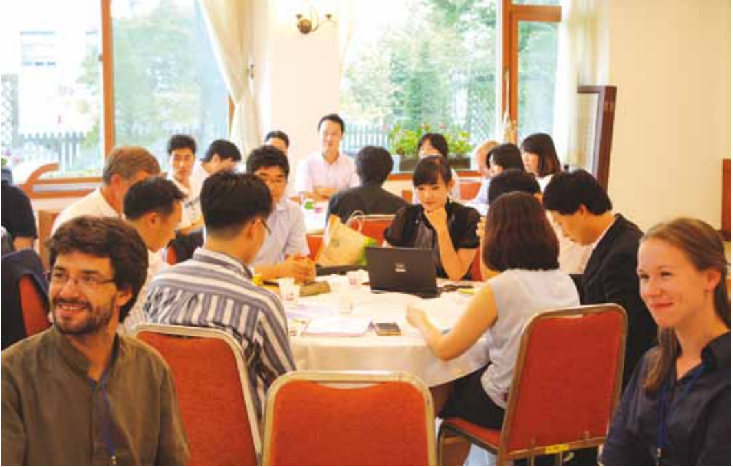
Student session at the 3rd Conference of the ASEM Education Hub of Peace and Conflict Studies.

Korea and, to a lesser extent, the claimants to the Spratly Islands. There is also the territorial disagreement between Thailand and Cambodia over the access to the temple of Preah Vihear. Other non-resolved, long standing, internal disputes are the self-determination conflict in West Papua (Indonesia), the repression of the Hmong minorities in Laos because of their support to the US in the so-called Secret War in Laos during the Vietnam War. Even in those cases that were settled through a peace or ceasefire agreement – with the Moro National Liberation Front in the Philippines in 1996, the Gerakan Aceh Merdeka in Aceh in 2005 and with several armed groups in Burma and Northeast India during the 1990s – new episodes of violence have often occurred and the risk of renewed conflict has not completely disappeared. Finally, there are several countries whose political stability is threatened by massive demonstrations (Thailand), frequent rumours about military coups d'état (the Philippines) or the holding of elections boycotted by the internal opposition and the international community (Burma).